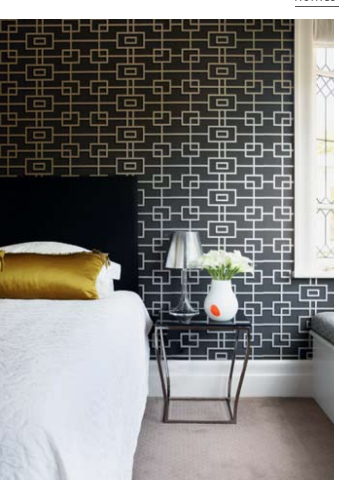
"I like an uncluttered look, but not one that is cold and sterile. I really like homes that feel personal and have a heart"