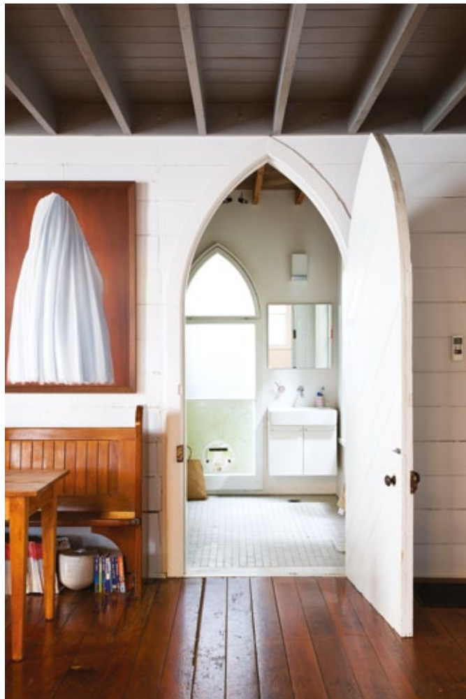
ABOVE Original features that reflect the building's former life as a church have been carefully preserved, including this gorgeous set of echoing arches. RIGHT Doors in the master bedroom lead to the built-in wardrobe, then up a ladder to the turret.