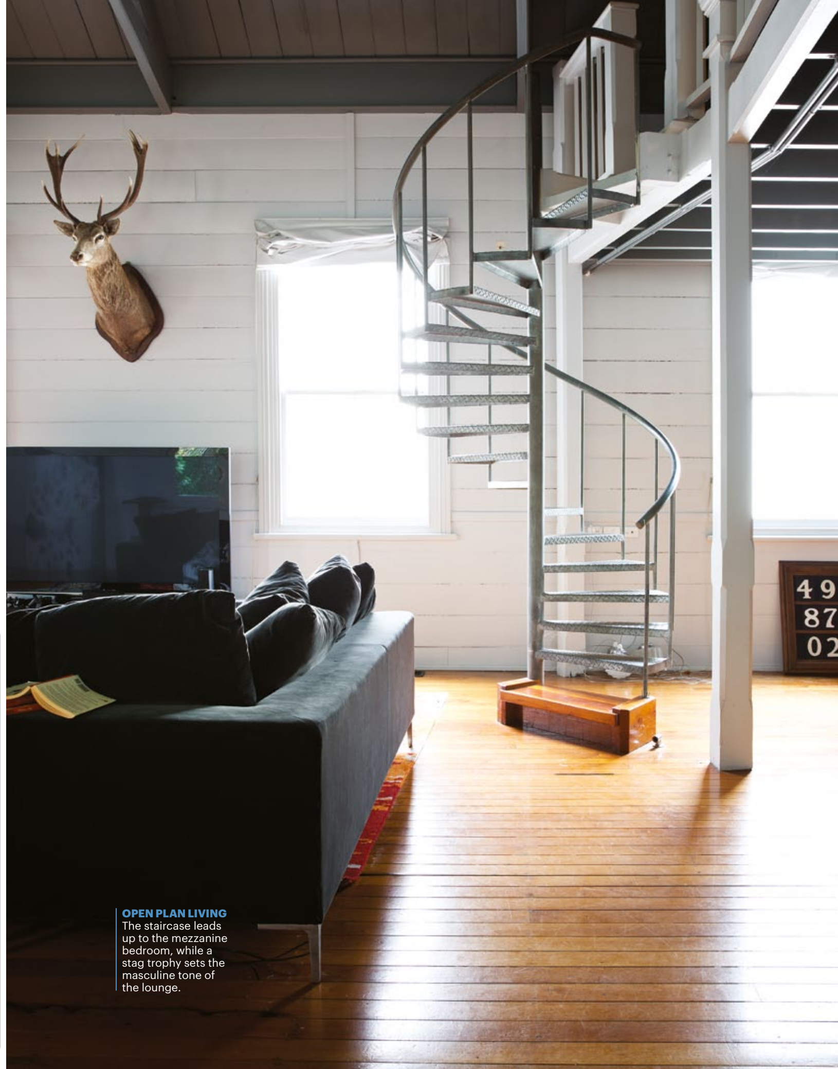
OPEN PLAN LIVING The staircase leads up to the mezzanine bedroom, while a stag trophy sets the masculine tone of the lounge.